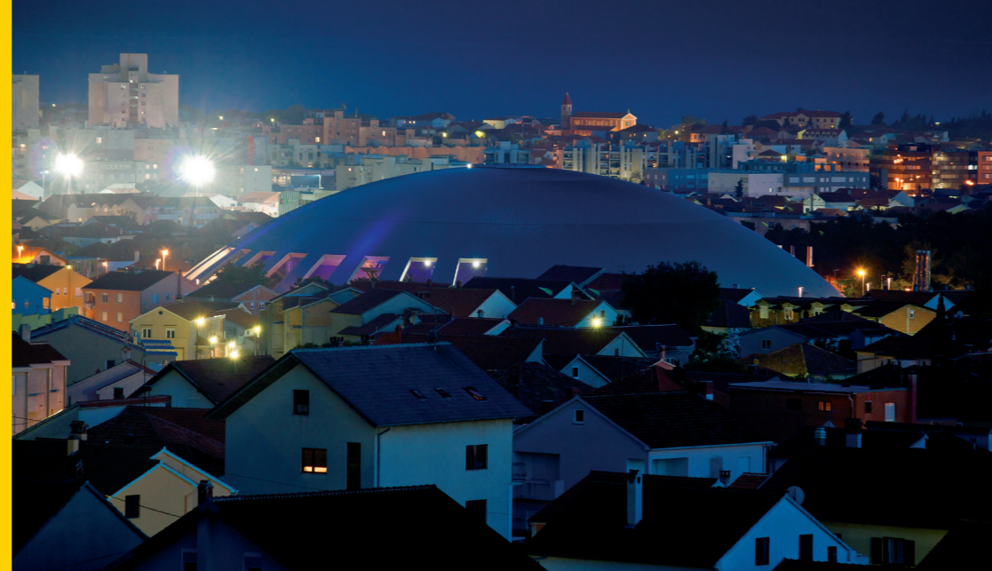
Višenamjenska gradska dvorana u sklopu Sportskog rekreacijskog centra "Višnjik" u Zadru/ Multifunctional city sports hall as a part of Recreation Sport center "Višnjik" in Zadar