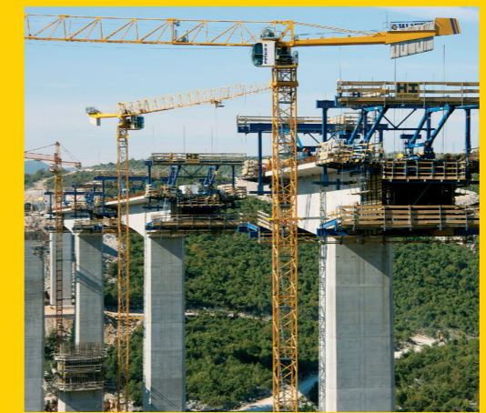
Izgradnja mosta Studenčica u sklopu izgradnje autoceste na koridoru 5c, dionica Počitelj- Bijača, poddionica Zvirovići-Kravice/ Construction of bridge Studenčica within construction of Motorway on Corridor Vc, section Počitelj-Bijača, sub-section Zvirovići-Kravice