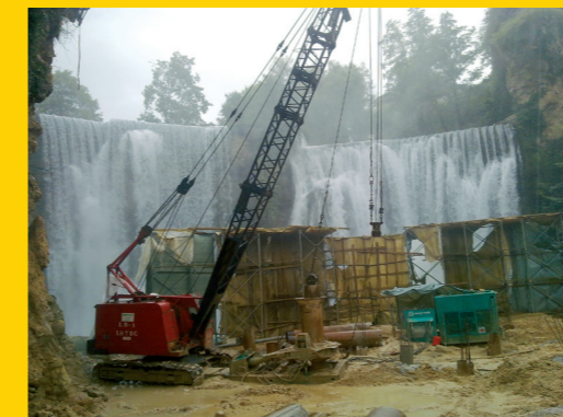
Sanacija vodopada i bučnice rijeke Plive u Jajcu/ Rehabilitation of waterfall and riverbed of river Pliva in Jajce