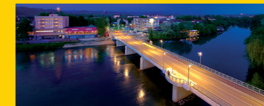
Rekonstrukcija mosta preko rijeke Sane u Sanskom Mostu/ Reconstruction of bridge over Sana river in Sanski most